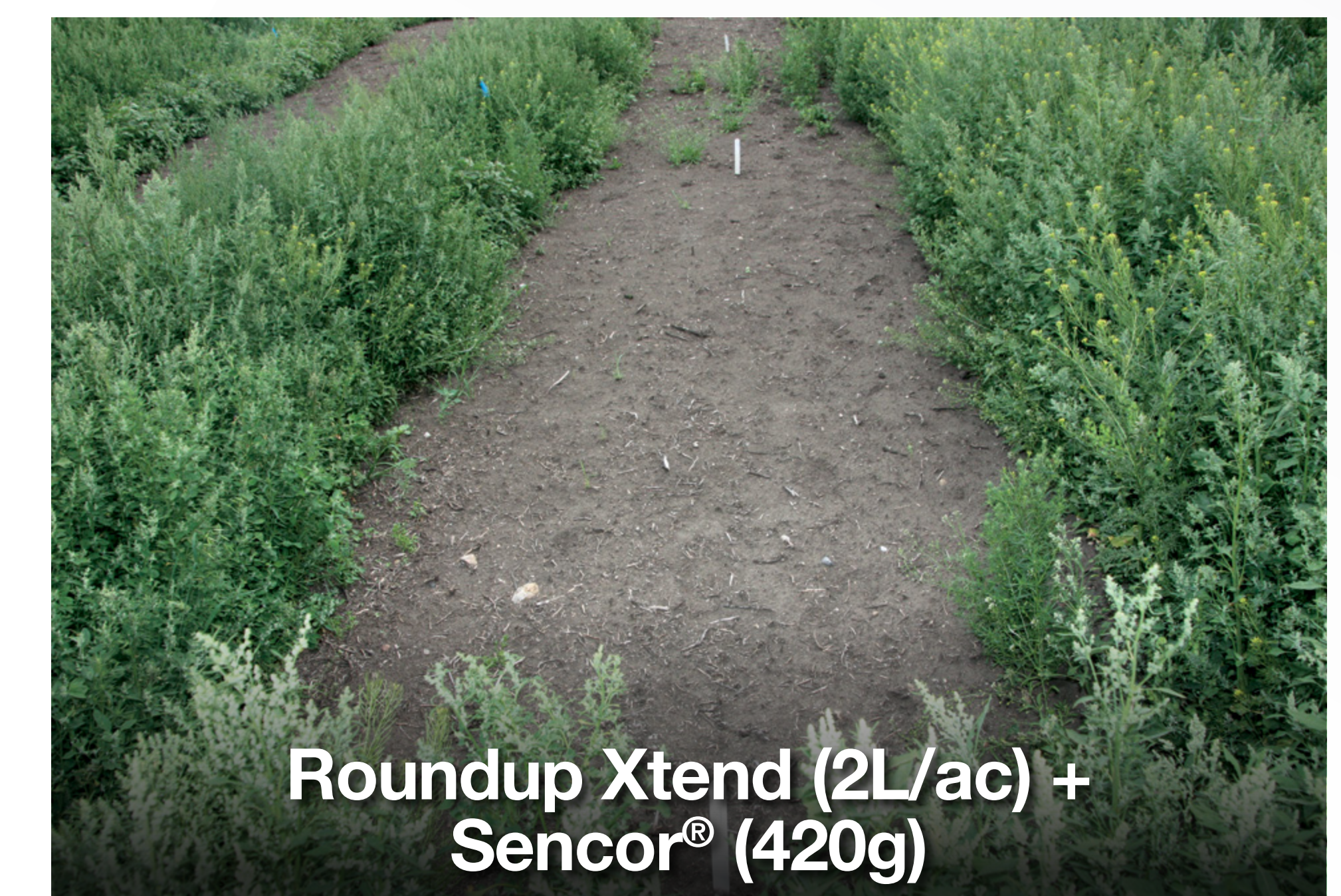
Treatments were applied during normal pre-seed burn off window with emerged kochia present.